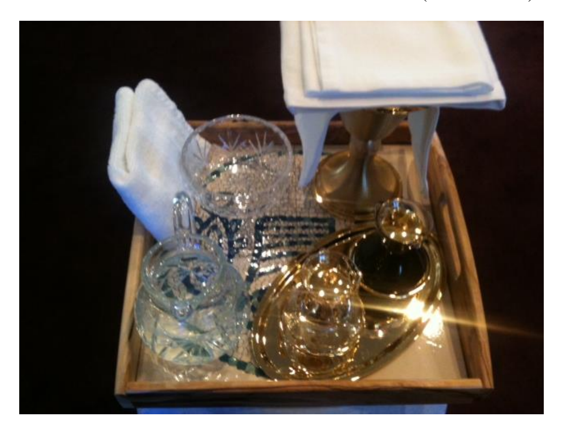
CREDENCE TABLE SET-UP OF SACRED VESSELS (WEEKEND MASS)